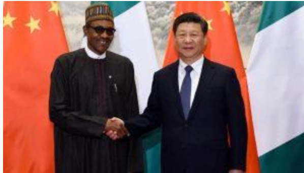
President Buhari & President Xi Jinping

October 1 st has the same significance for both China and Nigeria. It is their Independence Day, 1949 for China and 1960 for Nigeria. It means that China is older by eleven (11) years. Eleven years is a lot but not to the degree that China is ahead of Nigeria today.