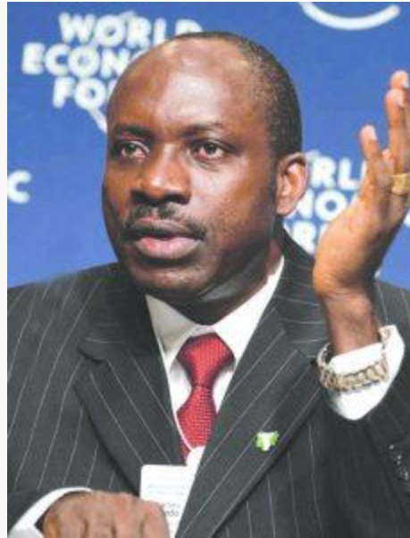
Prof. Charles Soludo