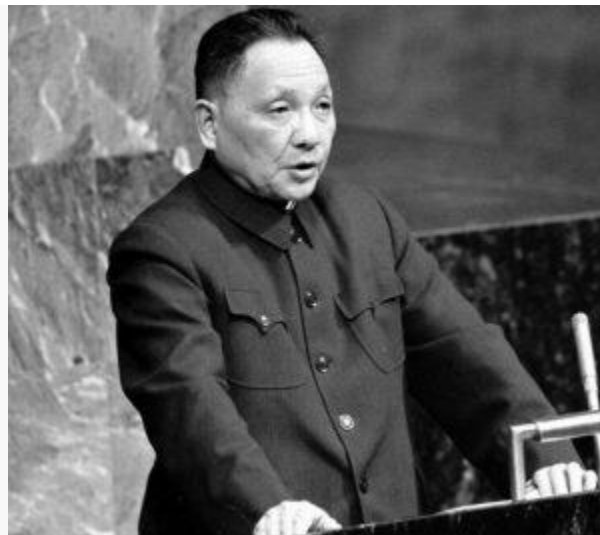
Deng Xiaoping – the undisputed architect of modern China