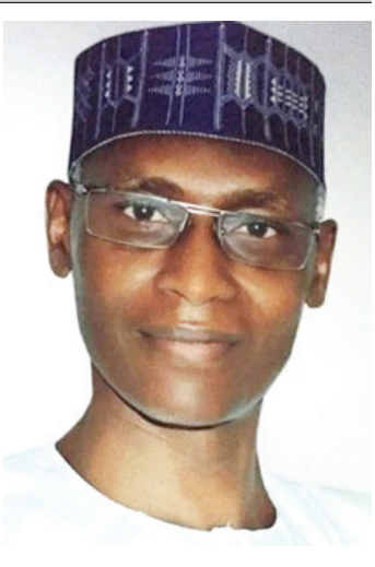
Senator Yusuf A. Yusuf representing Taraba Senatorial District

The story is the same for Baissa, headquarters of Kurmi Local Government Area, where the town, as well as other towns