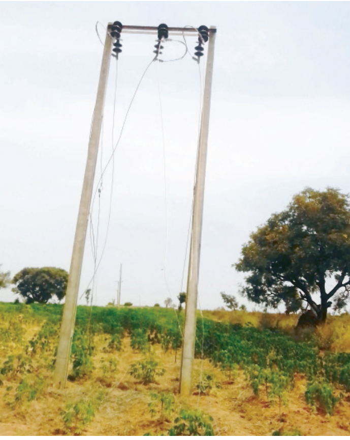
Vandalised cables which were to link Mutum Biyu with the National Grid from Jalingo, the state capital

Though contract for the electrification of the town