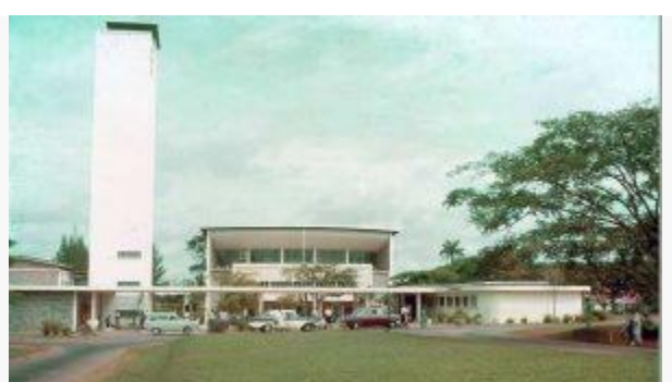
Nigeria's University of Ibadan which produced a Nobel Prize winner and numerous writers and scholars of global stature

The BBC, for example, calls Egypt, Nigeria and South Africa the African continent's power houses. Of the three, only Nigeria is completely missing from the list of one of the most recognised world university ranking exercises – the QS World University Ranking. Yet, universities remain the most credible measurement of a country's power because universities control the ideas, concepts and theories by which the world is understood and acted upon. Without universities, huge population, the economy, the military and even great land mass become liabilities to a country.