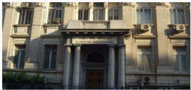
University of Cairo boldly identified