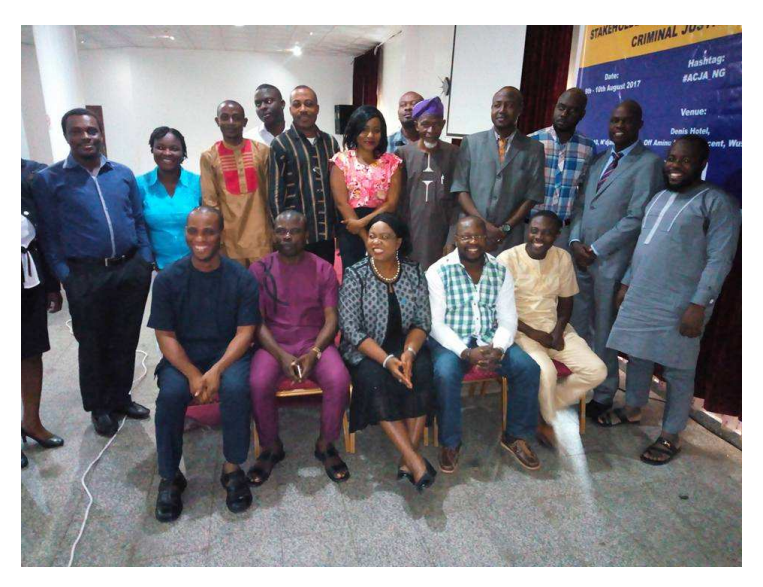
Cross section of participants Day 2 Inuagration of CSO Observatory