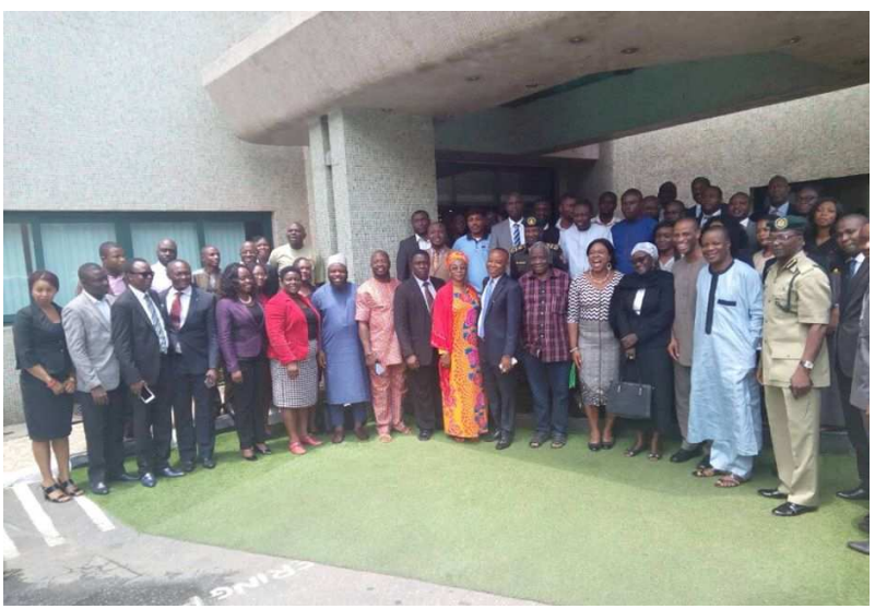
Cross section of participants after Day 1 of the workshop